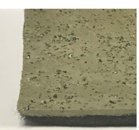
55 mils GC 2100 with 16 oz Cloth and Non-Skid Additive