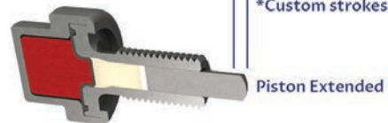
"Hot Position" - Liquid State

Typical Stroke Range 0.1" to 0.5" *Custom strokes available