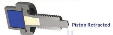
"Cold Position" - Solid State

This thermal phase change in the active region and resulting piston motion occurs over a narrow and customizable temperature range – typically within 10-15°F.