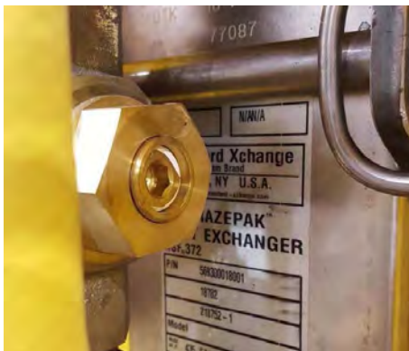
V3 INDICATOR CLOSED POSITION